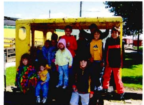
Children from several TCHE families enjoyed the trains