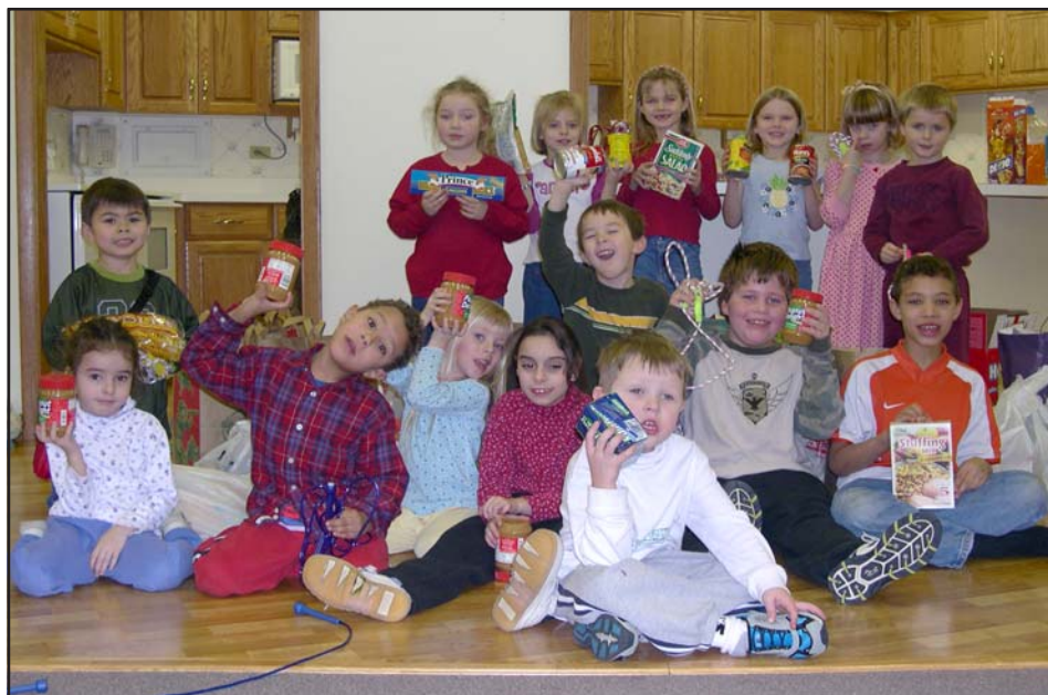
Cloverbud Sparks kids show some of the food that was donated to the Hope Chest.

receive this via email for many reasons—